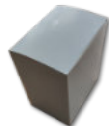
10 sets in one box