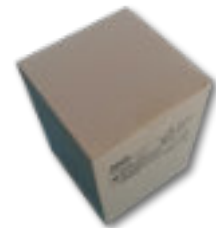
20 pieces in one box